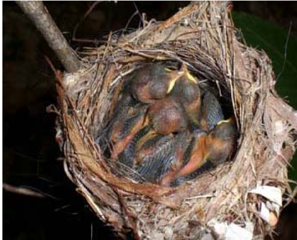
Four nestlings packed into a Black-throated Blue Warbler nest.